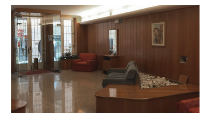
Top right: the lobby before refurbishing