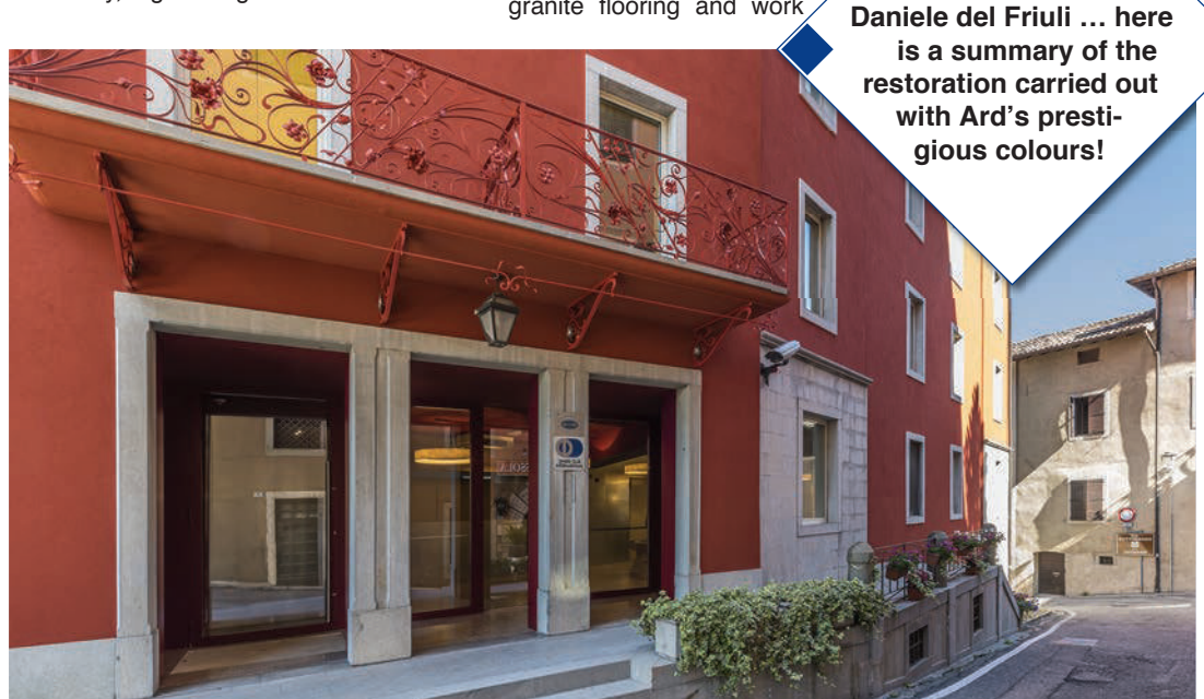
Photo: an exterior view of the hotel and one of Ard's colours ......