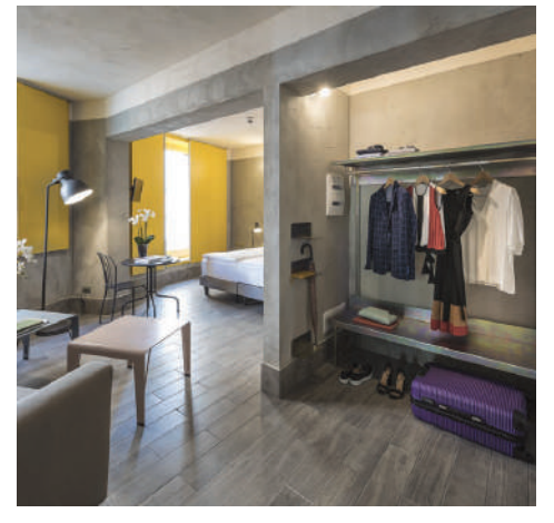
Owners - Hotel San Daniele Continual improvement will ensure that our business thrives ...

Renner Friuli is a perfect testimonial of Ard's products and thanks to their credentials, we can proudly affirm that the brand is branching out not only in Udine but also in the Friuli-Venezia Giulia region.