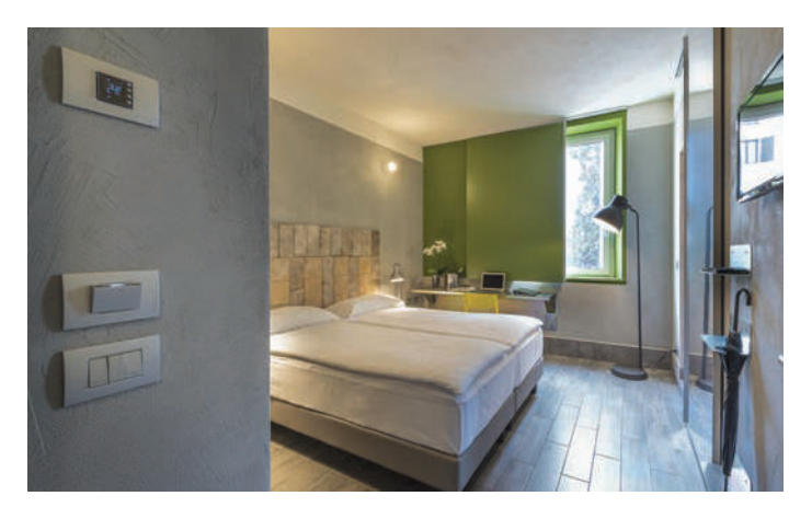
The "fresh & modern" design of the rooms ......